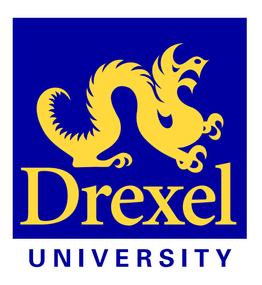
Figure 1.1: A figure float. Hello, here is some text without a meaning. This text should show what a printed text will look like at this place. If you read this text, you will get no information. Really? Is there no information? Is there a difference between this text and some nonsense like "Huardest gefburn"? Kjift – not at all! A blind text like this gives you information about the selected font, how the letters are written and an impression of the look. This text should contain all letters of the alphabet and it should be written in of the original language. There is no need for special content, but the length of words should match the language.

"Huardest gefburn"? Kjift – not at all! A blind text like this gives you information about the selected font, how the letters are written and an impression of the look. This text should contain all letters of the alphabet and it should be written in of the original language. There is no need for special content, but the length of words should match the language.